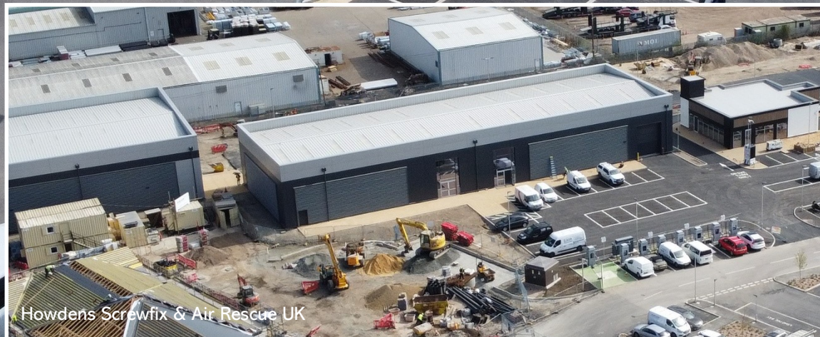
Howdens Screwfix & Air Rescue UK