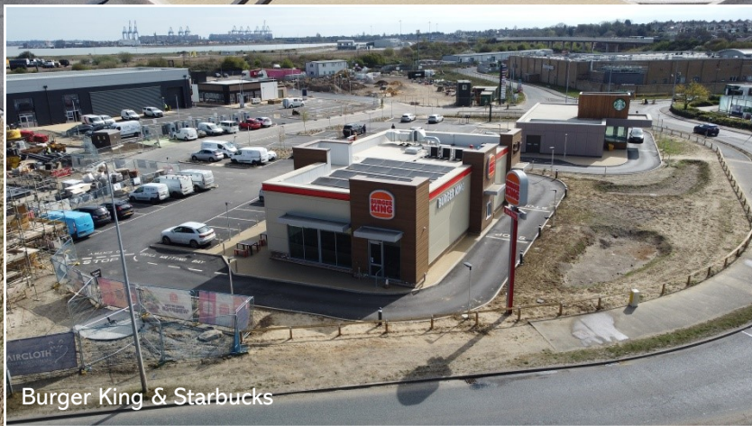
Burger King & Starbucks