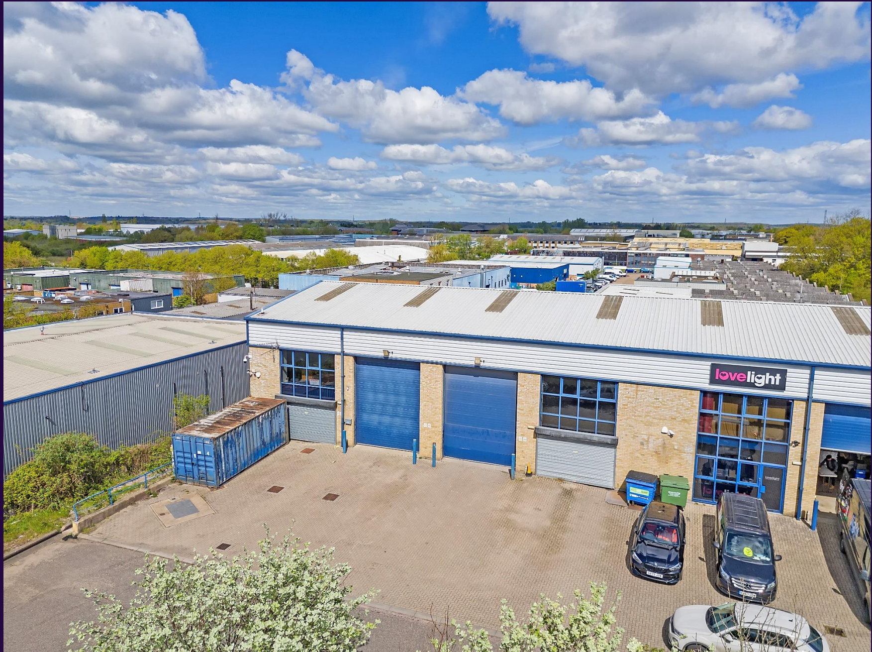
Units A & B, Westside Business Centre, Merring Way, Harlow, CM19 5RS