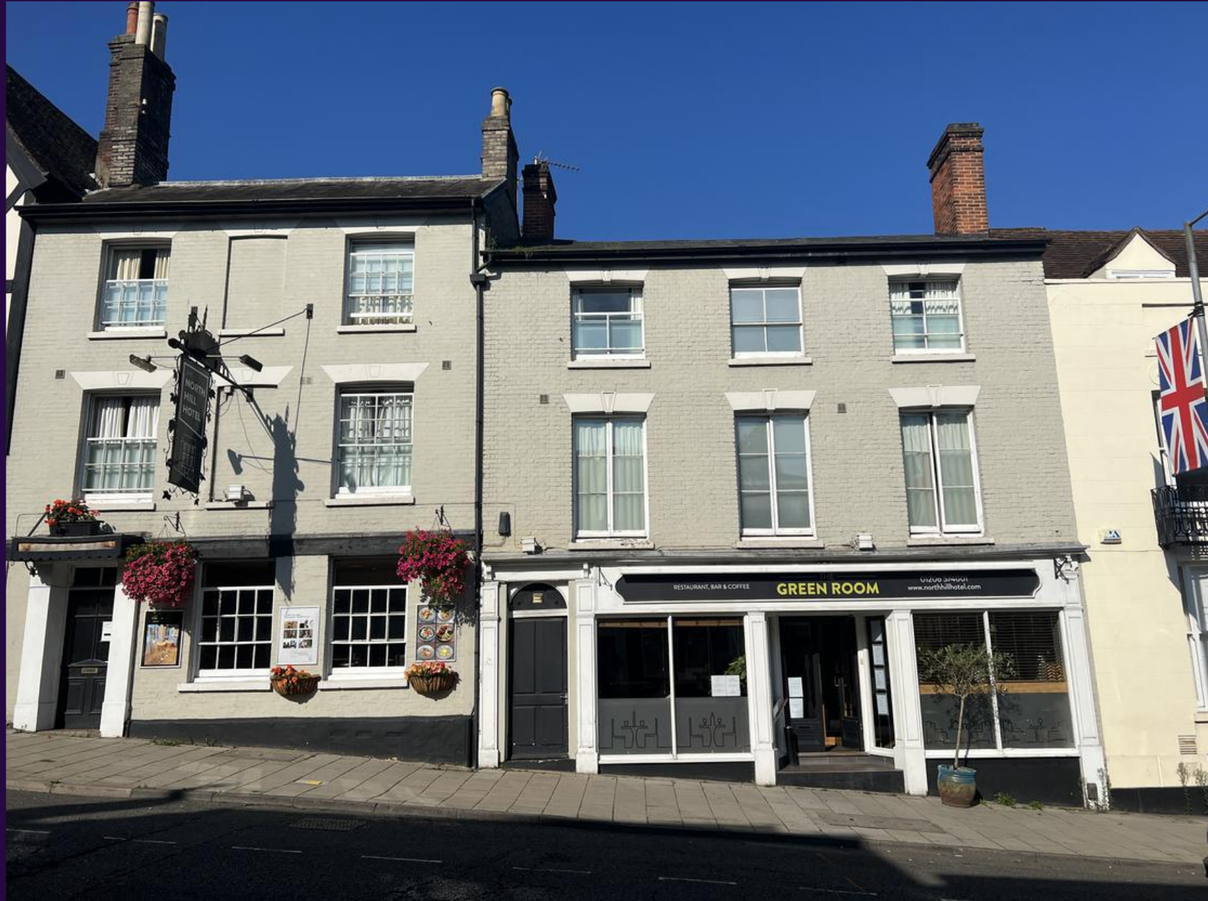
The North Hill Hotel, 51 North Hill, Colchester, Essex, CO1 1PY