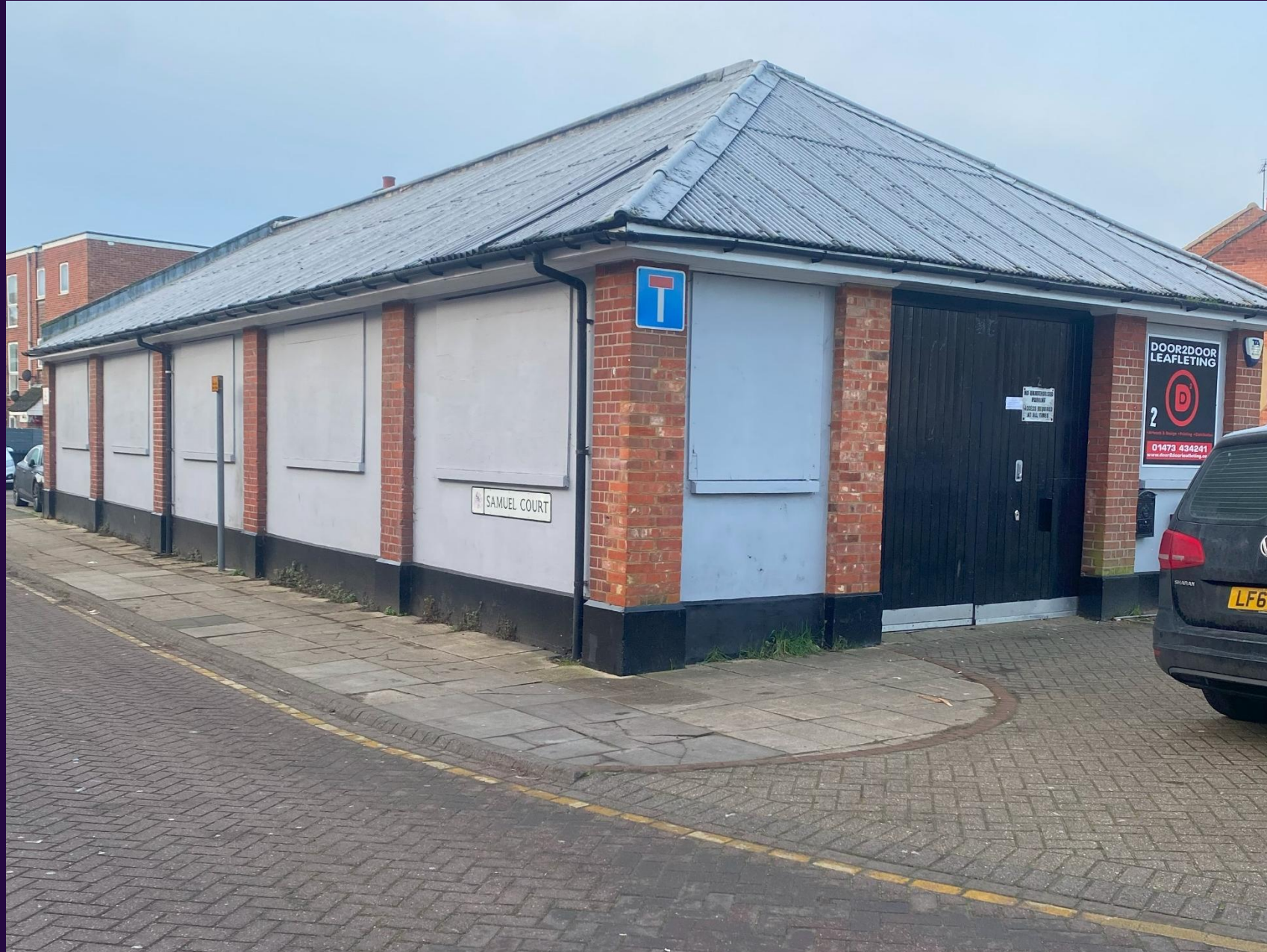
Samuel Court, Blanche Street, Ipswich, IP4 2EJ