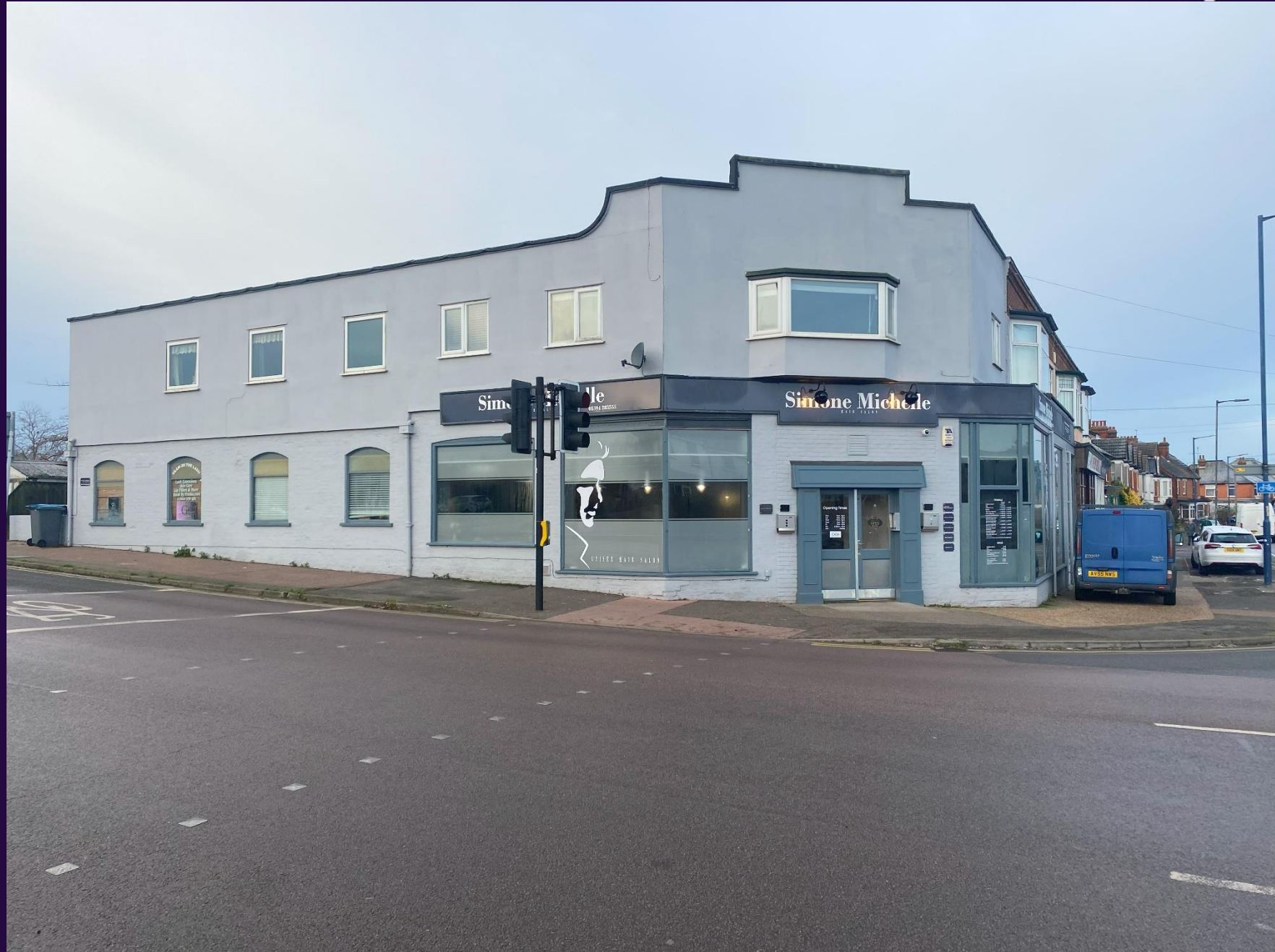
73-75 High Road West, Felixstowe, IP11 9AA