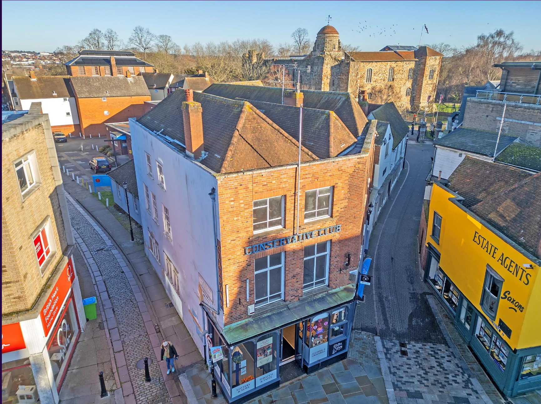
107 High Street, Colchester, Essex, CO1 1TH