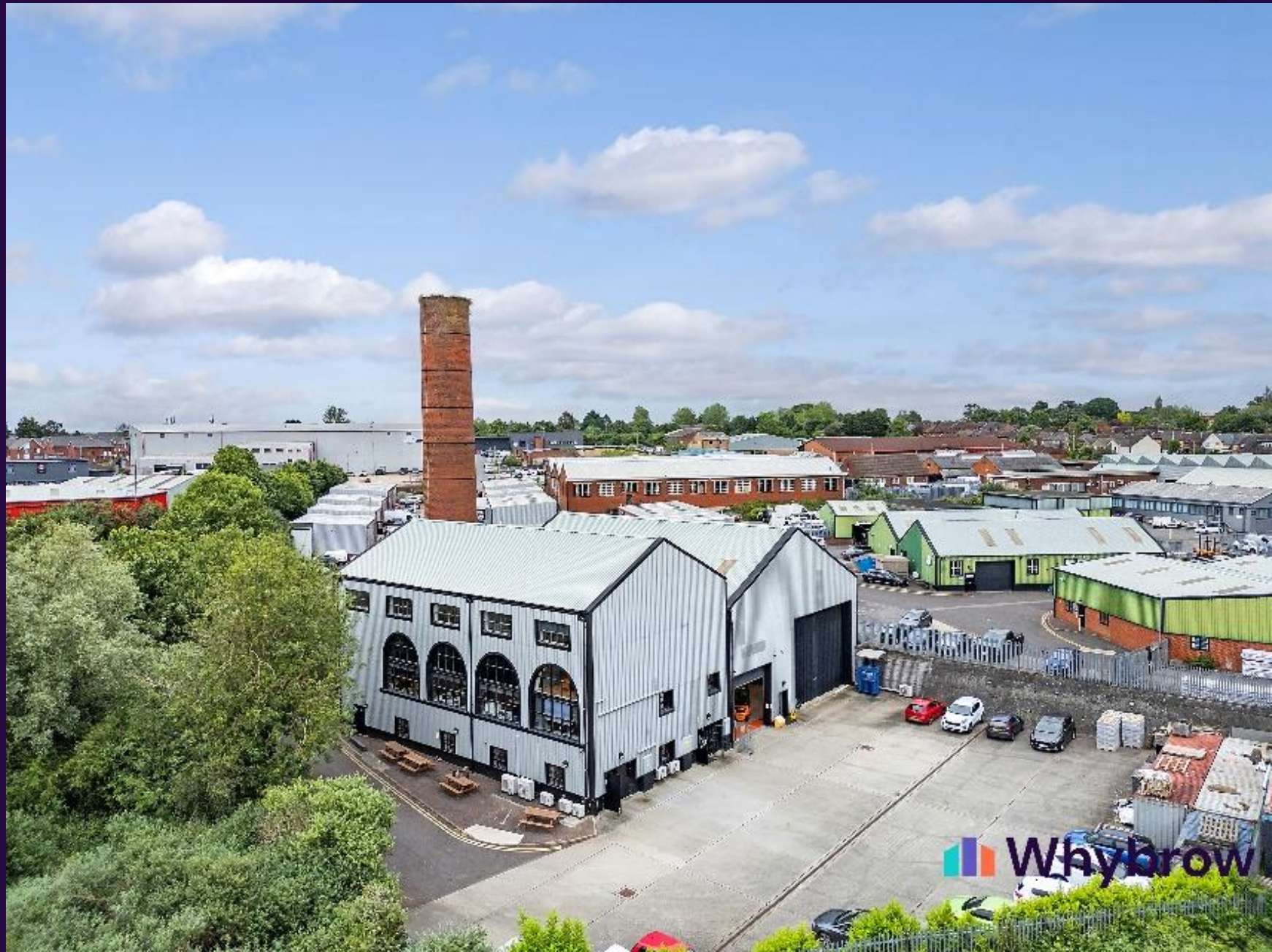
5C Enterprise Court, Lakes Road, Braintree, CM7 3QS