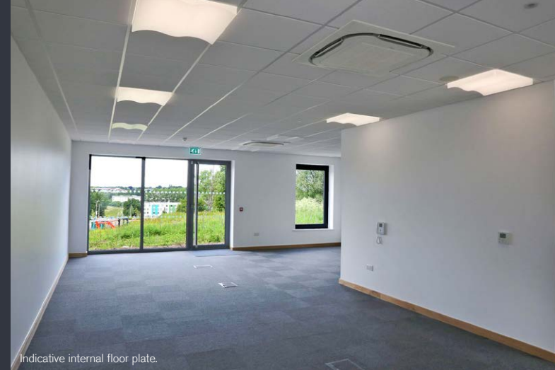
Indicative internal floor plate.

Comprising a modern self-contained two storey terraced building completed in 2019, the accommodation is built to an exceptional institutional standard including full access raised floors, lift, CCTV, 24hour security, comfort cooling, kitchen and WC facilities. Car parking spaces are provided in parking groves.